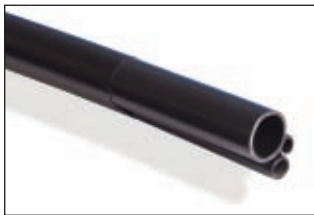
High Flow Jacketed Tubing 38883A 1 1/4" OD Liquid Discharge 1/2" OD Air Supply 5/8" OD Air Exhaust

Lightweight Red-Line and nylon tubing sets fit all QED connections down well, at the well head, and along the surface, with sizing in a range of ½ – 1¼" OD. Flexible Nitrile hose is easy to handle, coil, and bend in the field and fits all QED connections, with sizes from ⅜ – 1" ID.