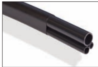
Standard Jacketed Tubing 38884A 1" OD Liquid Discharge 1/2" OD Air Supply 5/8" OD Air Exhaust