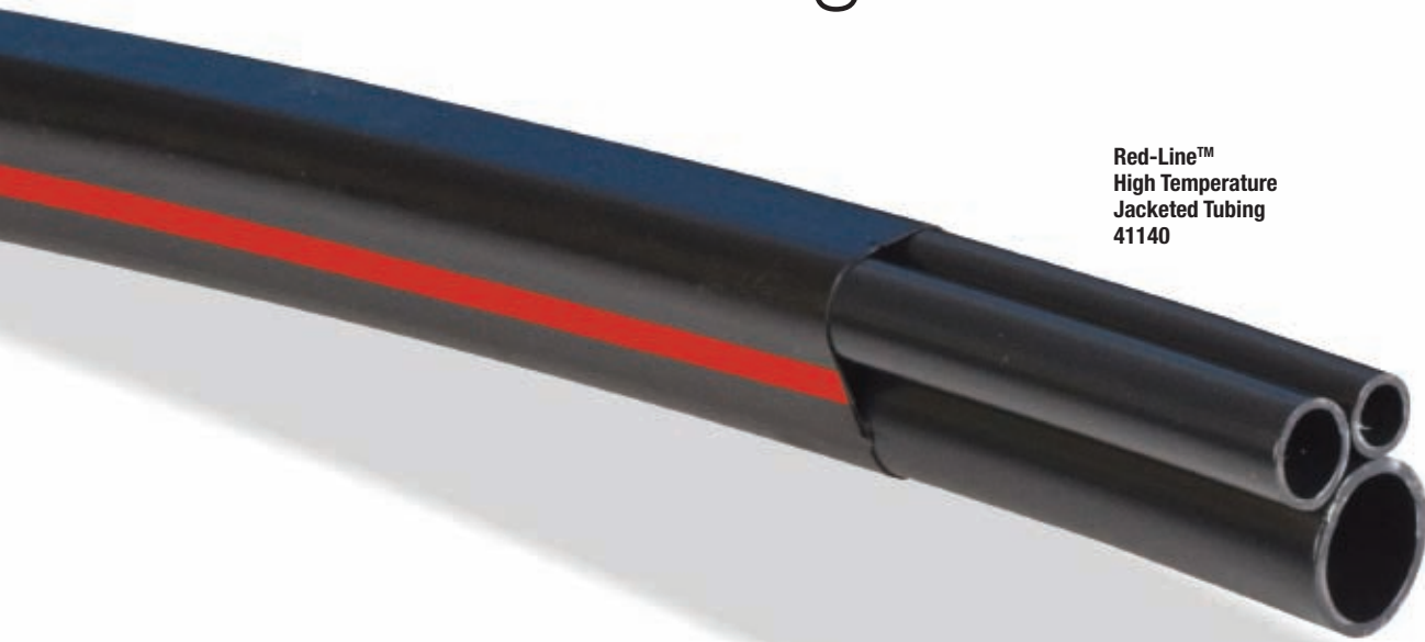
Red-Line™ High Temperature Jacketed Tubing 41140